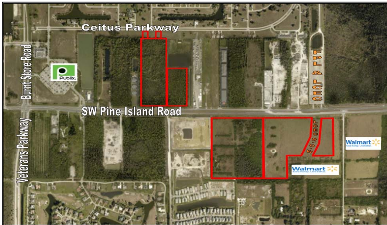
Population for 5 Mile Radius SW Pine Island Rd, Cape Coral, FL 33991