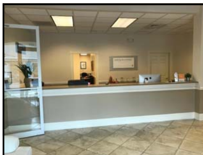
Reception Area/Pushing the Envelope