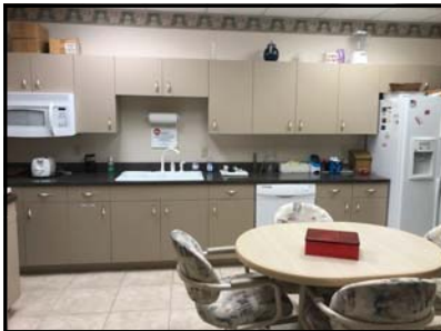
Full Kitchen/Royal Corinthian & Gladstone