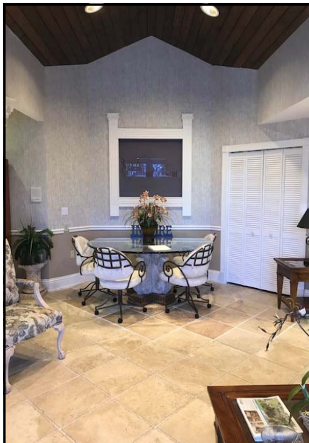
Main Entrance / Reception/Showroom Area