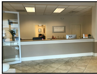
Second Entrance Reception Area