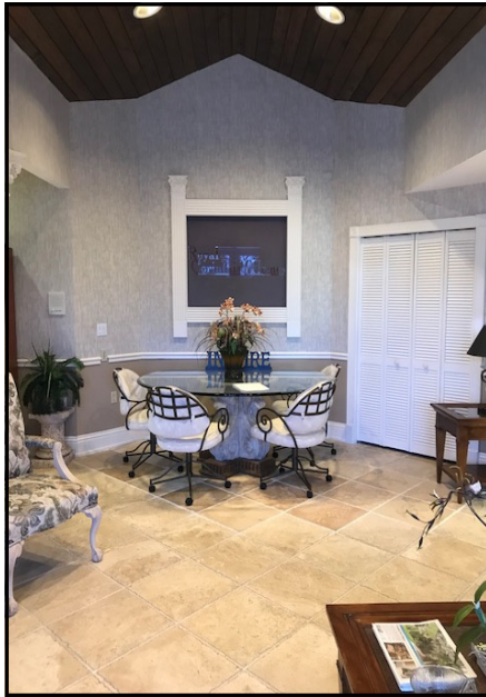
Main Entrance / Reception/Showroom Area