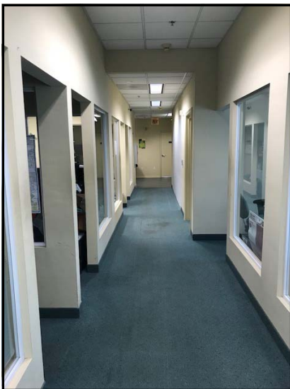
(8) 8' x 8' Offices