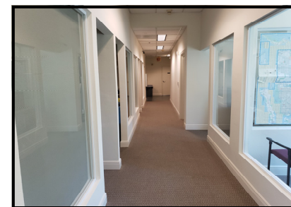
Office Area Hallway