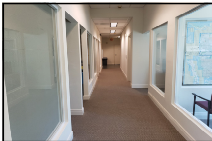
Office Area Hallway