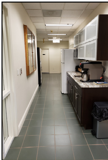
Shared Kitchen Area